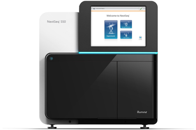
Figure 1: NextSeq 550 System—Proven platform offering the accuracy of Illumina NGS technology as part of a simplified DNA-to-results workflow.

The NextSeq 550 exome sequencing solution offers a tried-and-true, cost-effective workflow for investigating the protein-coding regions of the genome. It leverages industry-leading Illumina next-generation sequencing (NGS) technology 1 for comprehensive exome coverage. The NextSeq 550 exome sequencing solution includes integrated library preparation and exome enrichment, push-button sequencing on the proven NextSeq 550 System (Figure 1), and streamlined data analysis with the DRAGEN™ Bio-IT Platform and BaseSpace™ Sequence Hub (Figure 2). This simple workflow delivers highly accurate data to identify exome variants for clinical research applications, such as precision medicine, genetic disease, and inherited cancers. With minimal hands-on time and tunable output, the NextSeq 550 exome sequencing solution is a robust and powerful workflow for efficient exome interrogation.